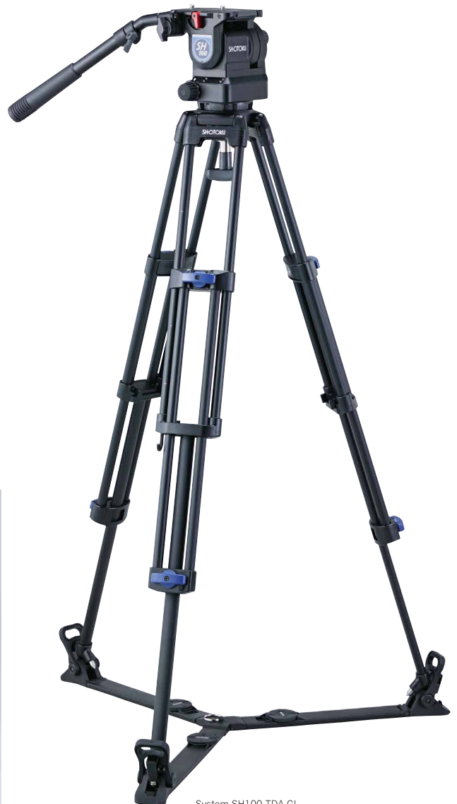
System SH100 TDA GL