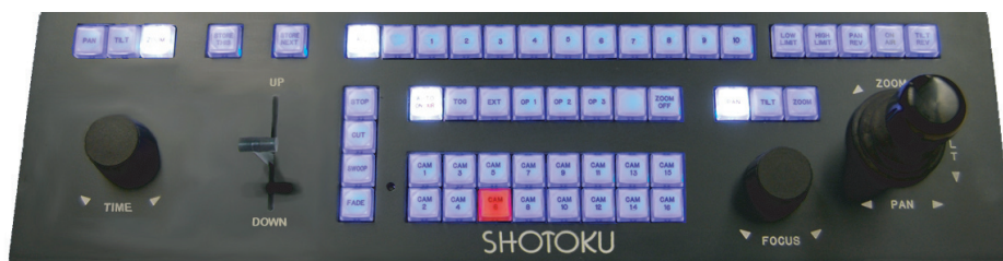
16 Camera TR-B Control Panel